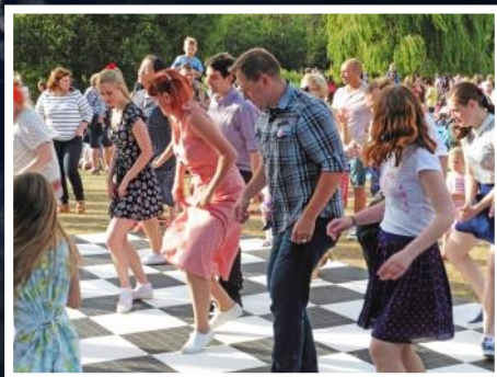
Village Weekend 2015