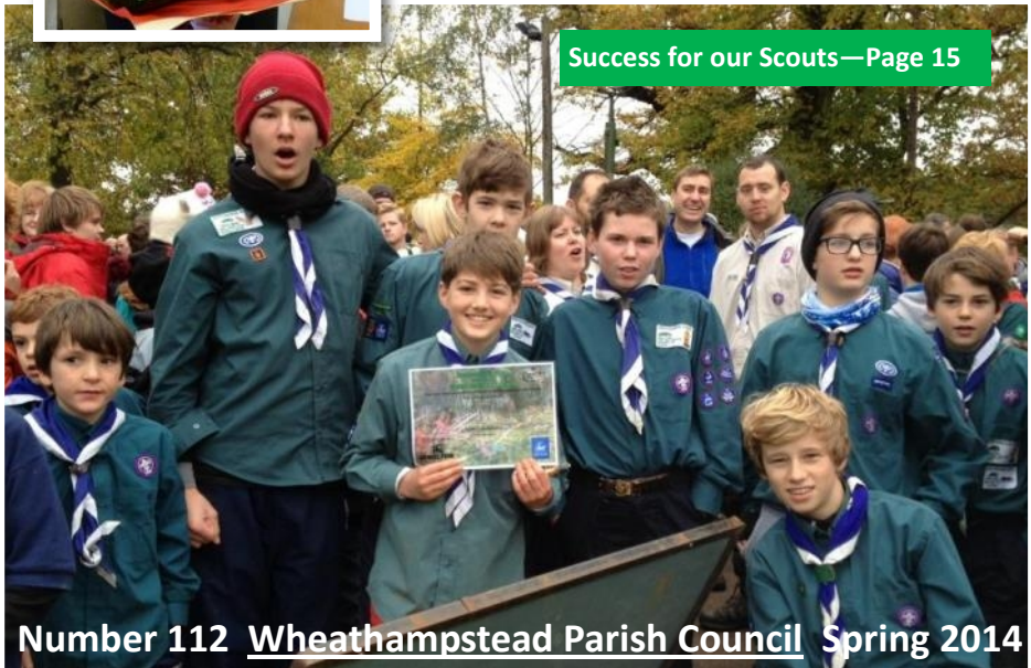
Success for our Scouts—Page 15