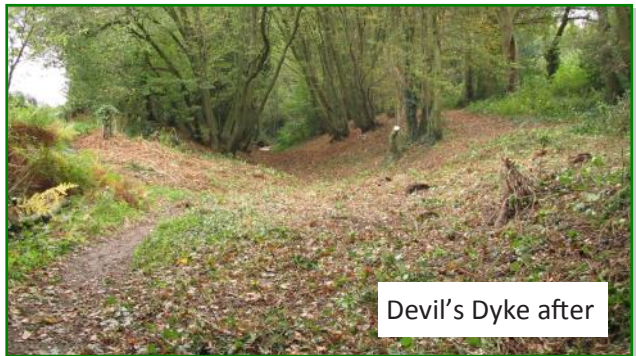
Devil's Dyke after

Our next sessions are at Butterfield Local Nature Reserve on 14 February and Gustard Wood on 14 March. Butterfield Road is an important piece of chalk bank, secondary woodland and grazed unimproved neutral grassland. Flowers