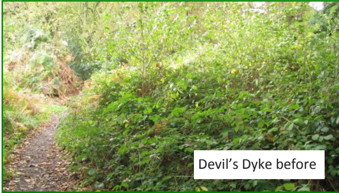
Devil's Dyke before

As mentioned in the previous edition of The Pump, two consecutive visits by our small but growing band of volunteers have made a significant difference to the entrance way and invading holly at the northern end of Devil's Dyke.