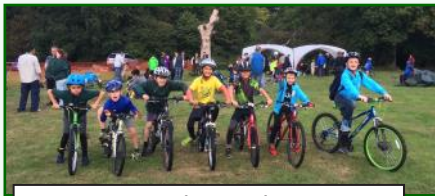
County Cubs Cyclo Cross

Mead Cubs are kept very busy, venturing out a lot as you can see from the pictures below.