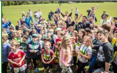
Cubs Centenary Chase with Steve Backshall and Thom Evans