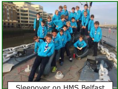
Sleepover on HMS Belfast

Cubs hope that their BBQ stall at the Wheathampstead 'Lights Up' evening on Thursday 24 November will be a popular attraction and raise funds to support more excursions and activities in the great outdoors.