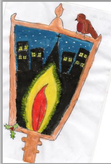
Isabelle Field Beech Hyde School