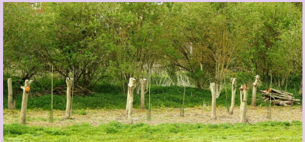
Two years ago

The plan is to pollard these trees at two-yearly intervals and it is now time to pollard them again. This work will be done by the end of February and the results of the pollarding will be used for willow spiling on the south bank of the river, as described on the opposite page.