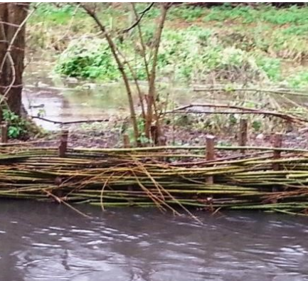
An example of willow spiling

We have taken advice from the Herts and Middlesex Wildlife Trust and the Environment Agency and have planned a programme of works to deal with this. In the next two months, we will install willow spiling along several sections of the river bank, using willow from the pollarding described opposite. We will also create a number of specific access points. While this will cause some disturbance in the short term, it will prevent more serious problems in the future.