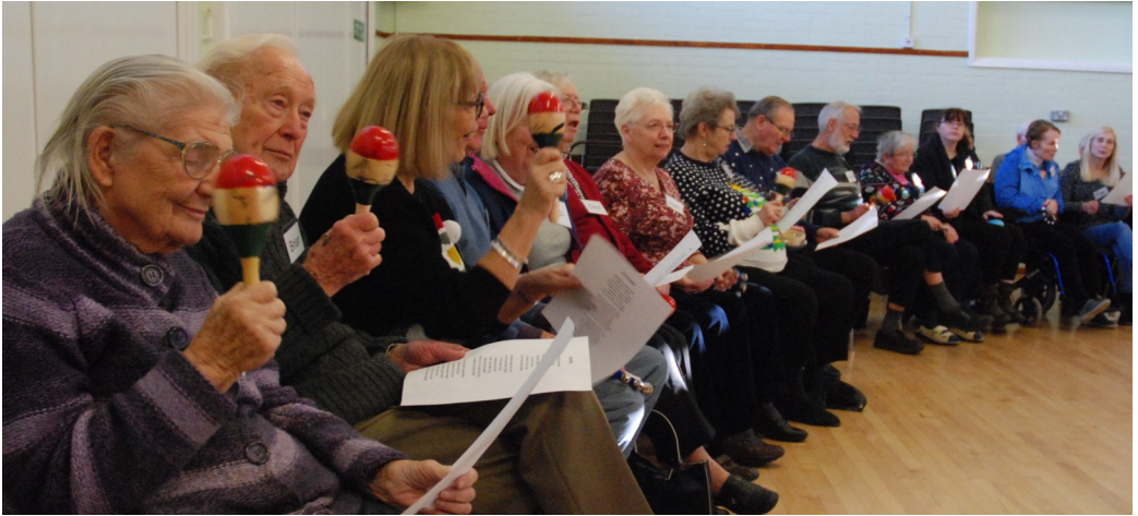
Herts Musical Memories class

‘Dementia’ describes a set of symptoms that may include memory loss, difficulties with thinking, problem-solving or language, and changes in mood or behaviour. The changes are often small to start with, but for someone with dementia they are severe enough to affect daily life.