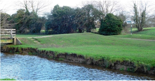
Erosion on the river bank

has gone back by up to a metre in the last five years. This widens the river which makes it become shallower and flow more slowly; this in turn results in silt covering the original gravel bed, as well as making the river less attractive to larger fish. The eroded material produces even more mud and silt. The popular access points are particularly badly affected.