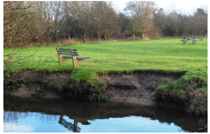
A popular access point